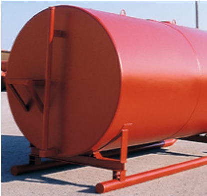
Heavy duty pipe skids shown here with a Pump Platform