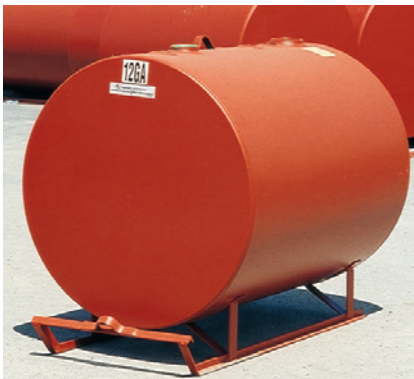
Light duty angle skids