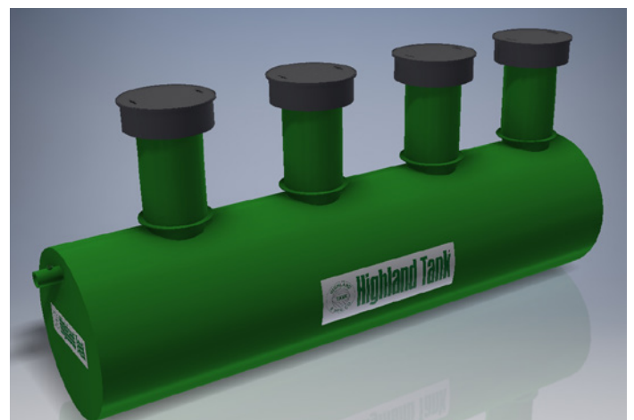
This diagram illustrates manway risers on a four basin PGI.