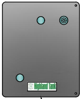
SINGLE CHANNEL ALARM PANEL - SHIPPED LOOSE