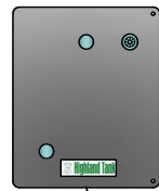
SINGLE CHANNEL ALARM PANEL - SHIPPED LOOSE