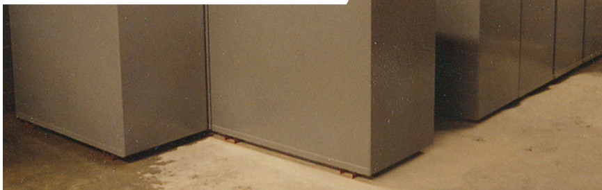
rectangular lube tanks