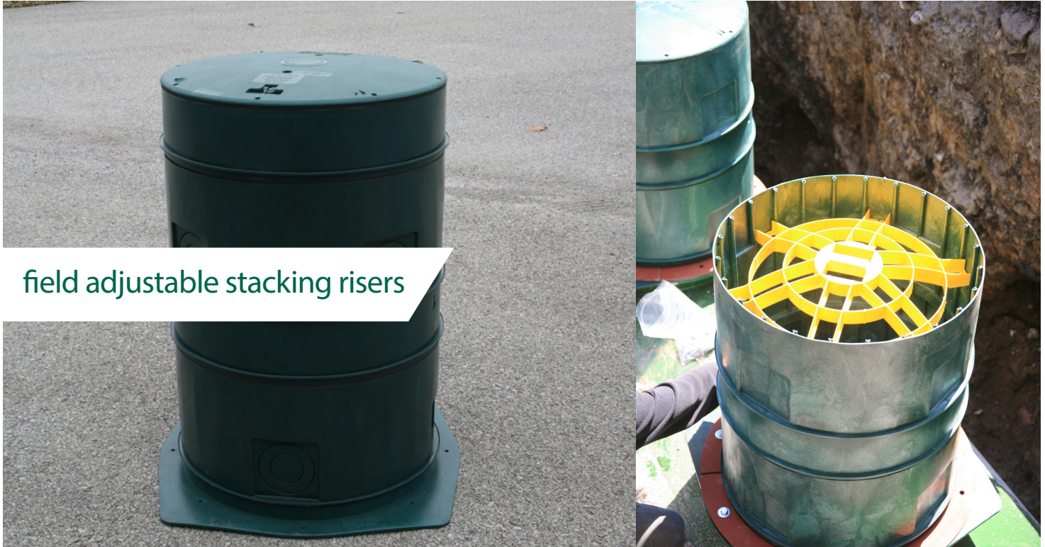
field adjustable stacking risers

customizable in the field for quicker and more accurate installations