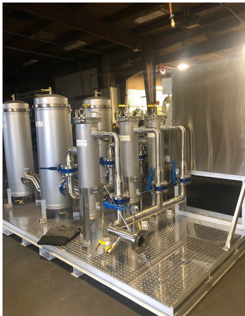
Advanced Filtration System

They will be holding water in tanks as needed while the water is being sampled and analyzed. If water is confirmed to meet their needs, it will be added back to their service water. Highland Tank's scope of supply for this system consisted of one HTC-J 2,000 gallon double-wall Oil/Water Separator with EZ Access Manways, hold down straps, concrete deadmen anchors, and duplex effluent pumps in the clear well.