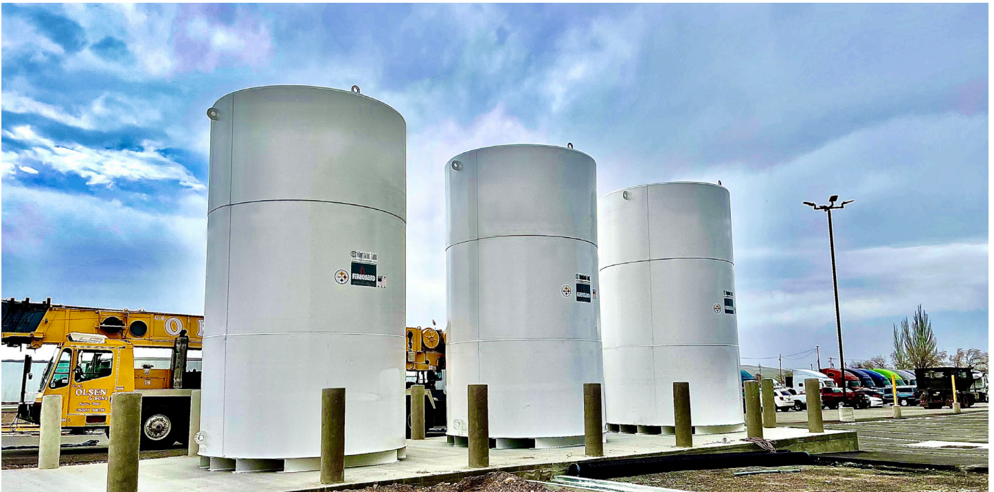
12,000 gallon Vertical Fireguard Tanks for fleet fueling.