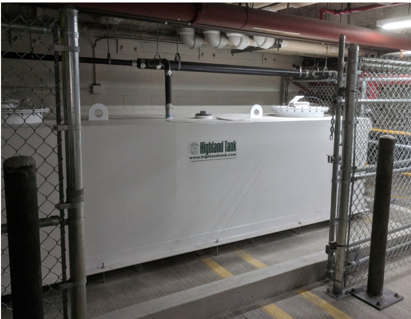
Highland Tank's Passive Grease Interceptors can be installed in parking garages for easy pump-outs.

Highland Tank is a leader in the grease interceptor industry. Please contact us to discuss your grease interceptor requirements.