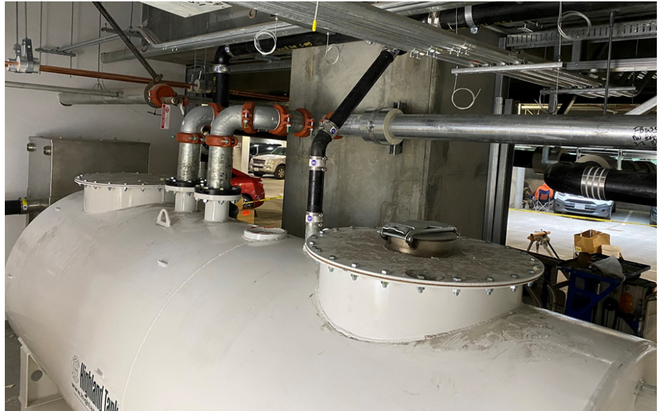
Highland Tank PGI in parking garage with remote pump out.

Rectangular interceptors require more labor due to the flat bottoms and hard-to-reach corners, but they use a smaller footprint. Other options include heating and insulated interceptors for aboveground applications that require freeze protection or enhanced separation.