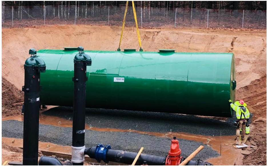
20,000 gallon HighGuard Bottom Drain Fire Protection System (HD-FPT-BD)

Water/Fire tank design and construction is governed by codes such as American Water Works Association (AWWA) AWWA D100-21 "Standard for Welded Steel Tanks for Water Storage" and the National Fire Protection Associations (NFPA) NFPA 22-2018 "Standard for Water Tanks for Private Fire Protection".