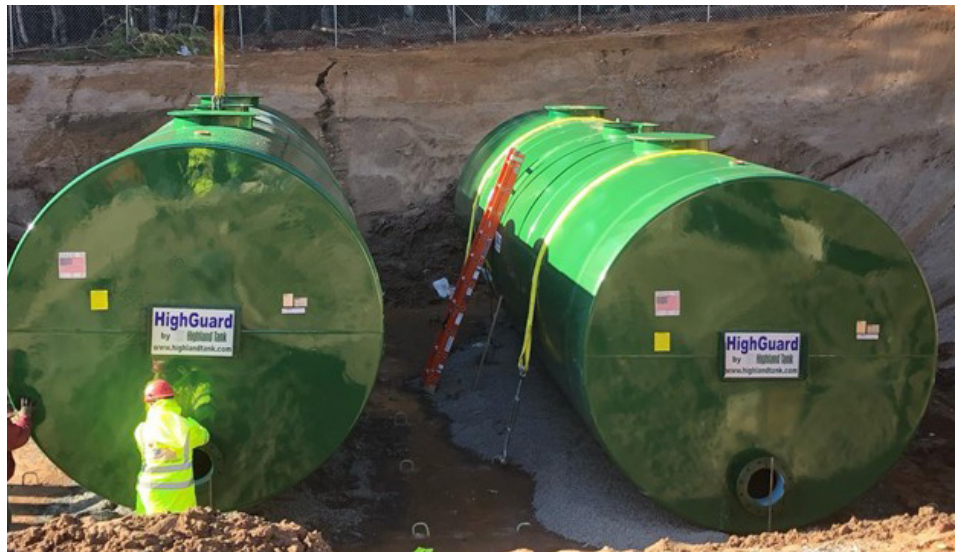
Underground Fire Protection Tanks with HighGuard Coating System

The system is proven in all types of environments and weather conditions per ASTM D4141 and ASTM G90 for exposure coating retention. Inside a fire/water storage tank, the approach to corrosion control is different.