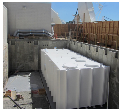
15,000 Break Tank with external bracing