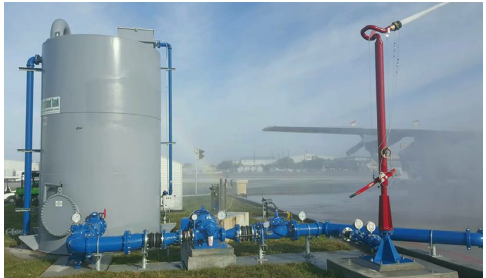
10,000 gallon HighGuard Bottom Drain Fire Protection System (HD-FPT-BD)

Highland Tank Break Tanks are an automatically filled reservoir that maintains a sustained water supply in a pump(s) application. It is important to size the Break Tank correctly as well as provide means for primary and secondary auto fill capabilities.