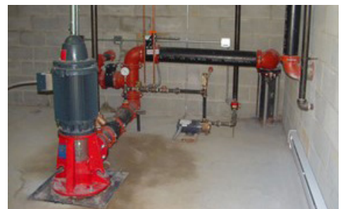
20,000 gallon HighGuard with pump well (HD-FPT-PW)