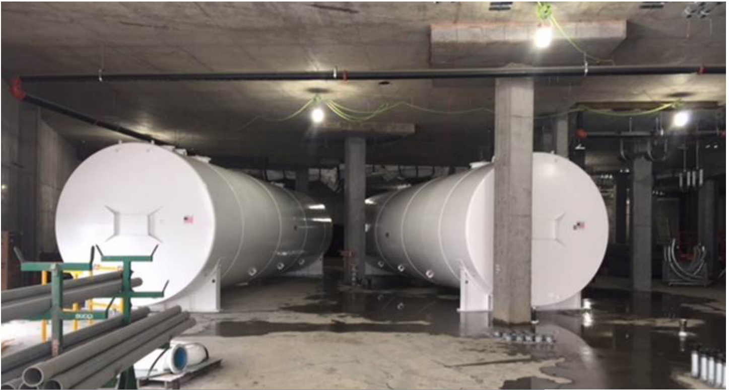
Highland Tank's fire protection tanks are designed for use in fire protection systems and are required by fire codes in many commercial, industrial, and institutional buildings for use with automatic sprinkler systems.