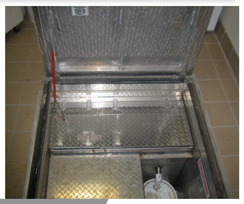
The flush-with floor automatic grease interceptor (shown on right) eliminates the need for costly service as well as odors.