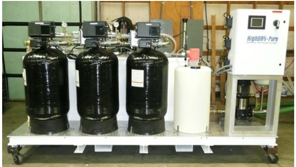
Figure 2: Rainwater Harvesting System skid

With the "GREEN" movement, the use of retention/detention, SCU technology and rainwater harvesting has become more wide-spread to reduce the environmental impact of development and population growth, especially in municipalities with finite water resources. LEED architects, engineers and builders have long recognized Highland's protected steel water tanks for their strength, durability and functionality.